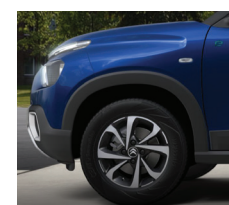
15" ALLOY WHEELS