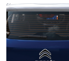
REAR DEFROSTER & WIPER