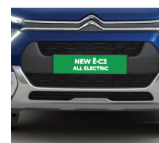
FRONT / REAR SKID PLATE